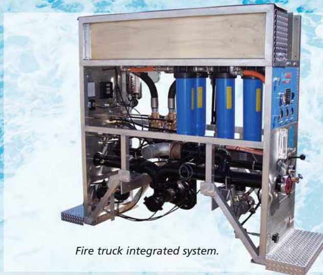
Fire truck integrated system.

100 YEARS Darley ® Trusted Worldwide Since 1908